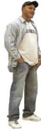
Untucked shirt, slogan T-shirt, undershirt, logo baseball cap, faded jeans