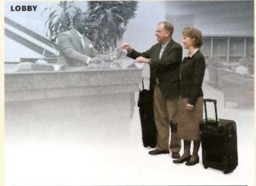
Appropriate dress for visiting Bethel