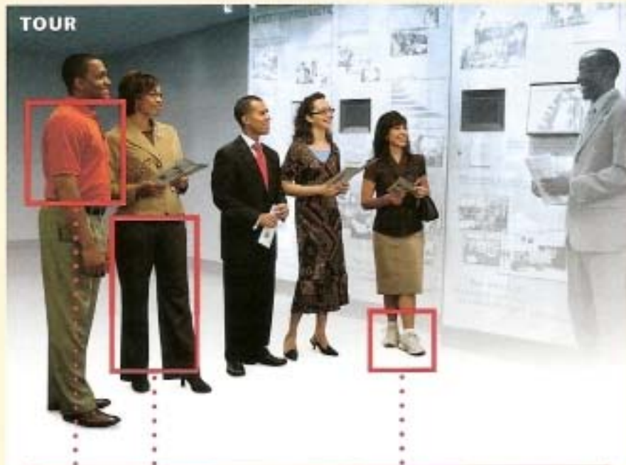
OVERLY CASUAL FOR TOUR

“When [we are] visiting any of the branch offices of Jehovah’s Witnesses . . . , our dress, grooming, and conduct should be similar to what is expected of us when attending meetings for worship at the Kingdom Hall.” ( Organized to Do Jehovah’s Will , p. 138)