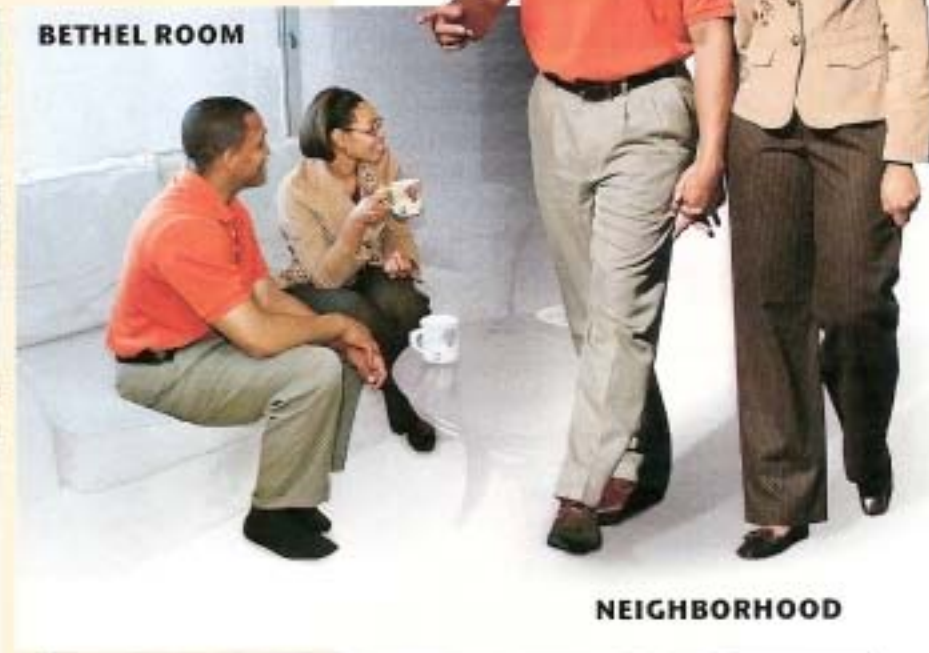
Acceptable casual wear for visiting a Bethel room or traveling in the neighborhood